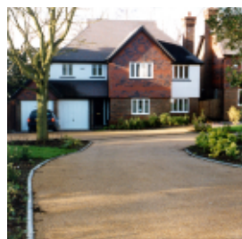
Patios & Courtyards